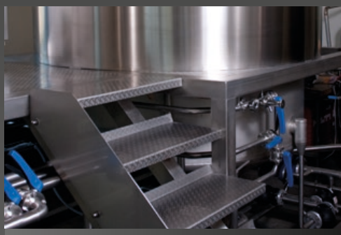
Slip-resistant in the field of industry