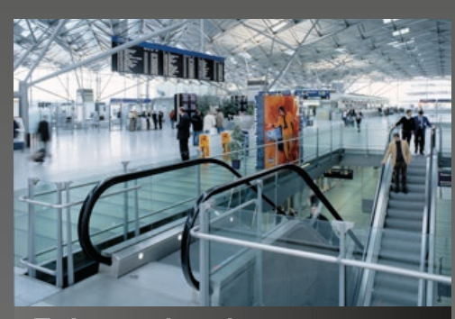
Enhanced outing optimisation in public areas